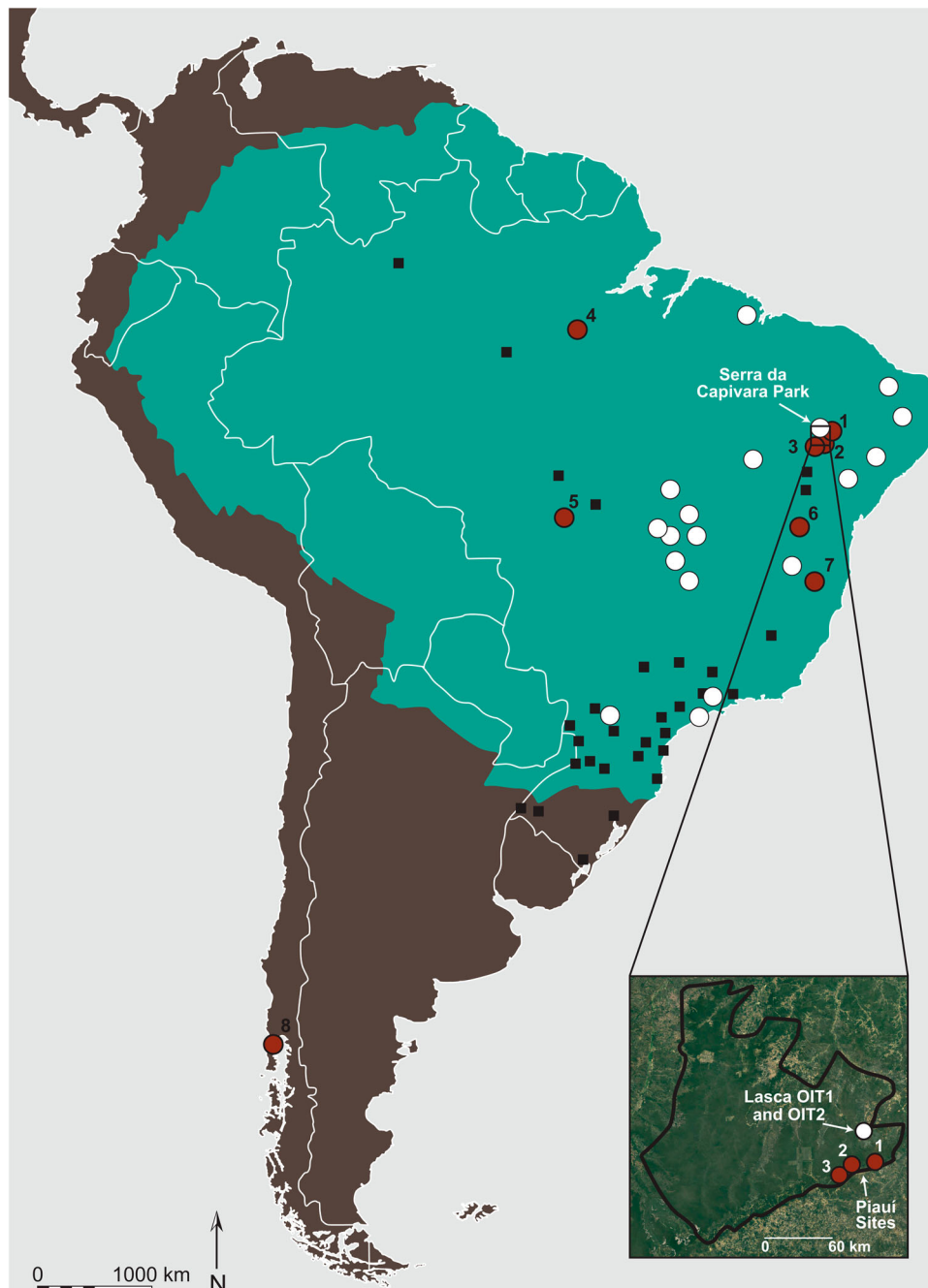
Figure 1 Map of South America showing general distribution of tufted capuchin monkeys (shaded green), capuchin monkey spontaneous stone tool sites (white circles), major archaeological sites (red circles), and fishtail point sites (black squares): 1, Boqueirão da Pedra Furada; 2, Sítio do Meio; 3, Toca da Tira Peia; 4, Pedra Pintada; 5, Santa Elina; 6, Lapa do Boquete; 7, Santana do Riacho; 8, Monte Verde (adapted from Lahaye et al. 2013; Loponte, Okumura, and Carbonera 2016; Ottoni and Izar 2008; Proffitt et al. 2016).

In any case, new genomic data and analyses indicate that a single wave of people from northeast Asia rapidly